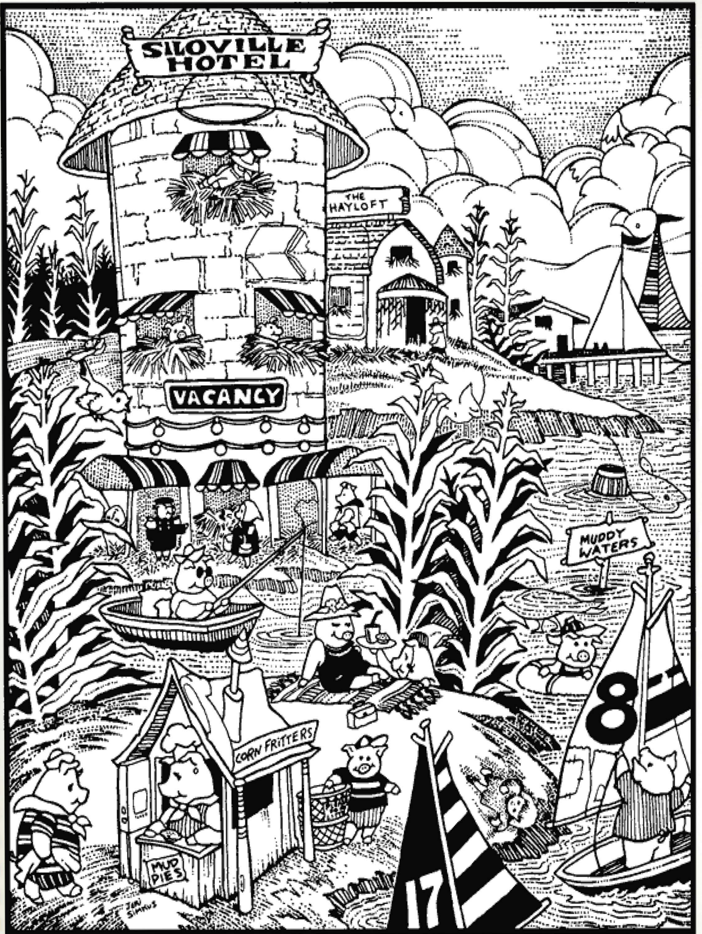
"PIGLETS TAKE A HOLIDAY" BY JERI SIMKUS